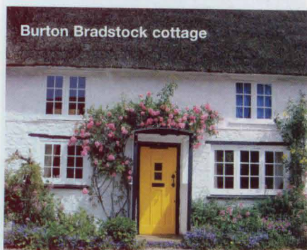
Burton Bradstock cottage

Don't Miss... The tiny 14th-century stone chapel of St Catherine's with its breathtaking views over the Channel.