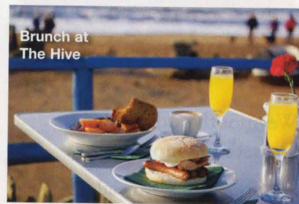
Brunch at The Hive

Follow the B3157 out of Bridport towards Weymouth and you will discover a couple of lovely villages.