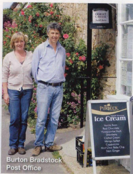
Burton Bradstock Post Office